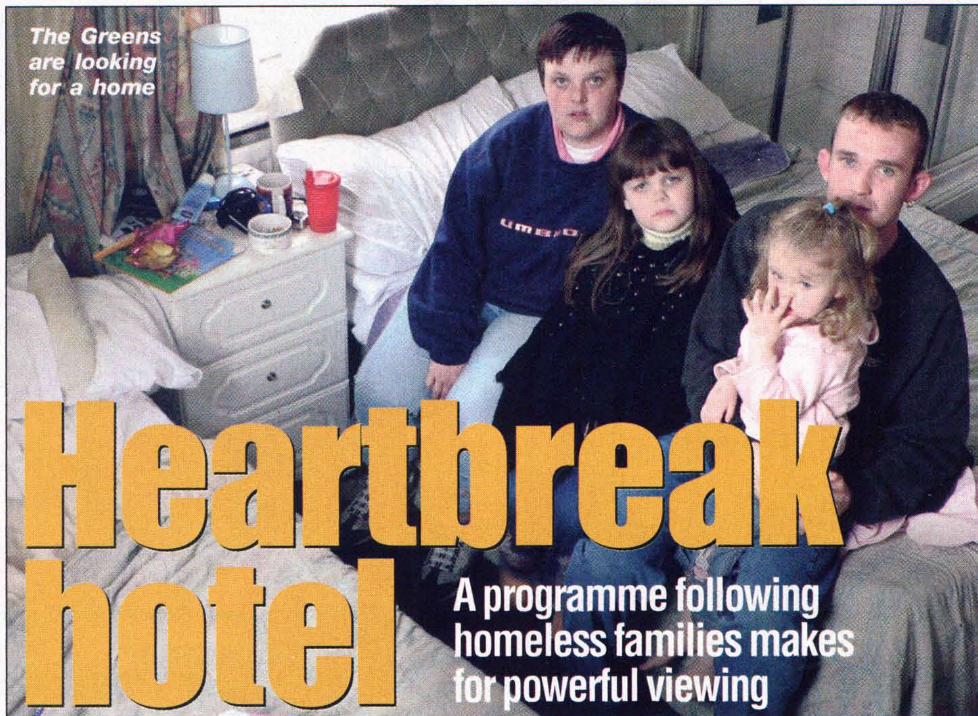
The Greens are looking for a home